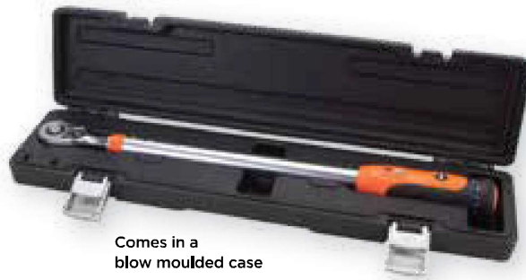
Comes in a blow moulded case