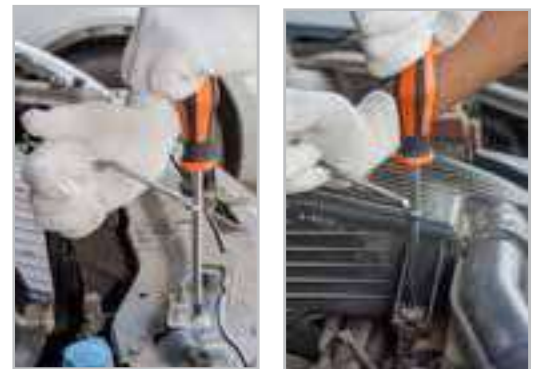
Hex shaft can be tightened using a spanner for high torque applications